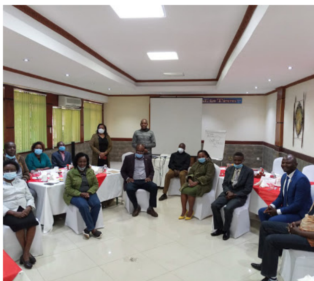
The VC with Some of the alumni during the breakfast meeting at Gracehouse Resort