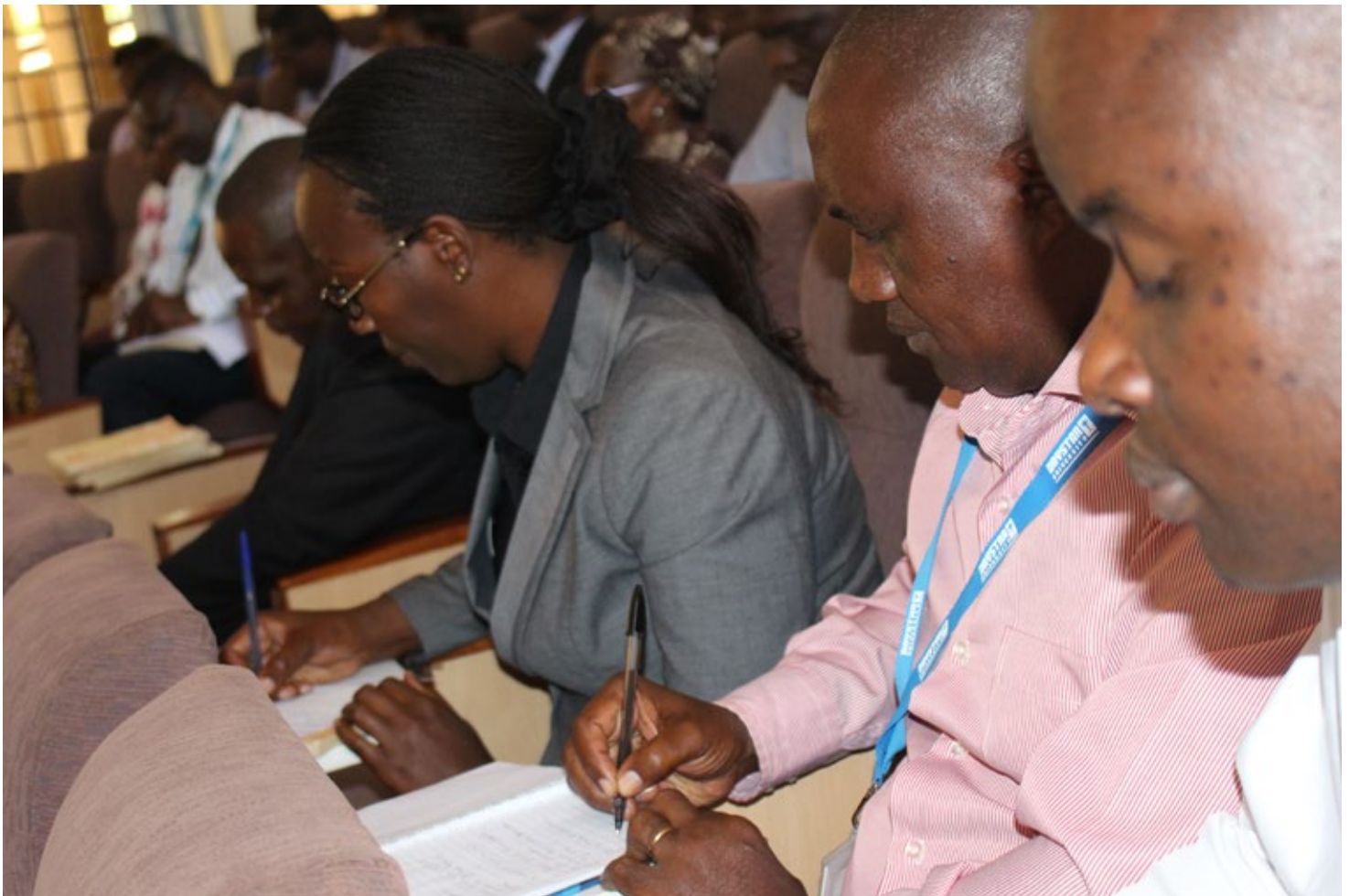
A cross Section of faculty who attended the Effective Small Group Leadership training